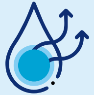
HARD DRY 6 hrs maximum

*Actual coverage may vary due to factors such as method and condition of application, surface roughness and porosity.