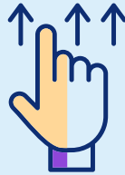
TOUCH DRY 15 mins maximum